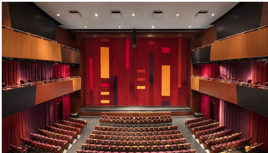
State-of-the-art, 961-seat performing arts space. The stage is a sprung floor built on rubber sleepers, 2- 3/4" layers of plywood topped with a black Masonite surface.